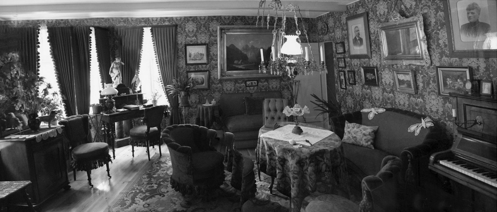
The parlour in Ludwig's familial ancestral seat.