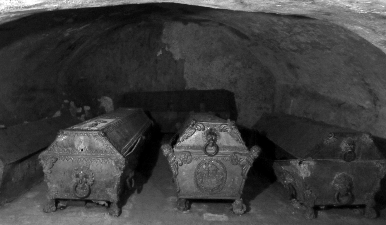
The vault in the villa. The coffins date to a time presumably before the current house was built. Evidently, Ludwig's ancestral home was built on the foundations of a much older building.

Update: The four teenagers from the Erz Mountains were not buried as presumed. The exhumation brought up only sandbags in the coffins. It is to be assumed that the bodies are in the lorry with Wolfskehl.