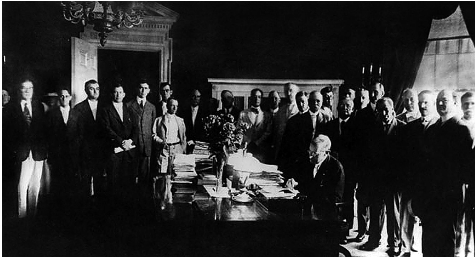
President Woodrow Wilson signing the document regulating the collective fight against the vampires. To conceal the true reason for the gathering, the White House has always claimed that it shows Wilson signing the Federal Land Bank Act, which was inspired by the German system

Just the normal things that a family acquires over the years. But he suddenly stops – the woman on the sepia photo, she is, without a doubt, the woman that keeps reappearing in his dreams. The back is dated: Agnes, July 1912, Biarritz. The young woman looks playful, happy, without a care in the world. It is – his great-grandmother, how could he forget? The great-grandmother who disappeared from her estate in Bohemia before the outbreak of the First World War, leaving husband and children behind without ever showing another sign of life. The family did not talk much about Agnes, only that she was, apparently, very eccentric and could presumably no longer stand life on the estate, choosing, so one thought, to elope to Paris with an officer. But why was he dreaming of her? Why did she appear so helpless? What did all this have to do with him?